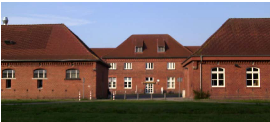
Archives Building, Muenster University