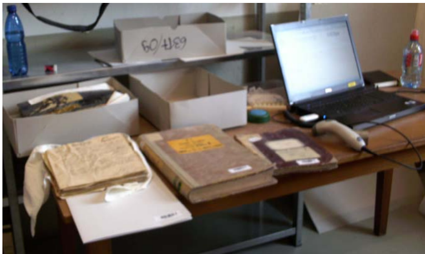
Workstation during a break from registering archives in ACTApro

and, if an image was taken to allow exact identification at a later stage, the item is linked to its image file. The damage to each item is classified as none, lightly, moderately or heavily and assessed against the categories soiled, mechanical damage (eg torn, parts missing), creased and buckled, deformed, mouldy, water damaged, and damage to text/ script/ image. The information on the database will not only be used to reconstruct the context of the holdings but also to identify the extent of and plan for the necessary restoration work. Pretty much all of the material is at least slightly soiled. A fine layer of concrete dust seemed to be just everywhere. It is estimated that 35% of the archives are heavily, 50% moderately and 15% slightly damaged. Sponsorship of restoration work to individual items is encouraged and more information is available on the City of Cologne's website at http://www.historischesarchivkoeln.de/paten_einleitung.php?lang=de