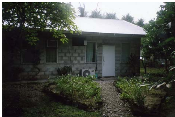
OLSH Archives Building