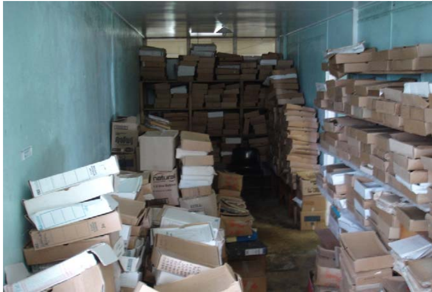
The Community Affairs archives room as we found it, 22 May 2007

mention Cyclone Heta. They were also in different locations – the majority were in the storeroom at the Niue Community Affairs building, while others were housed in shipping containers outside the office of Taoga Niue