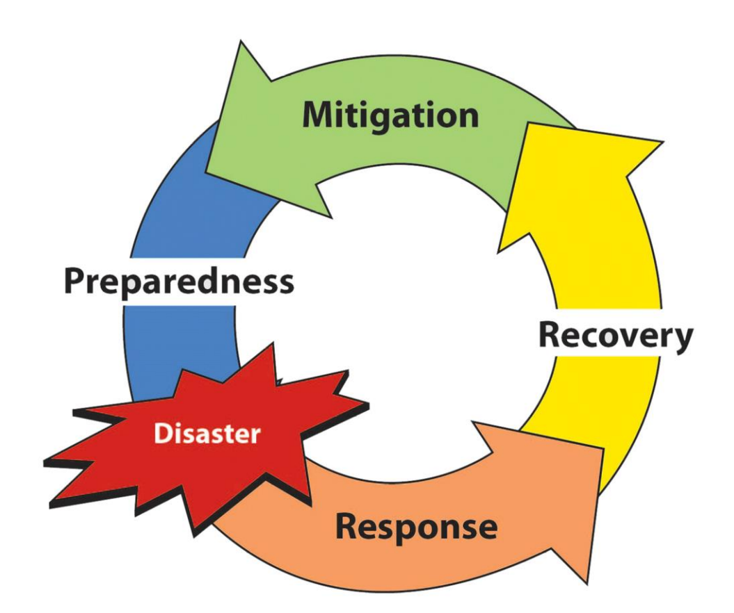
Fig 2 The four basic stages of disaster preparedness

Disaster preparedness consists of four basic stages: mitigation, preparedness, response and recovery.